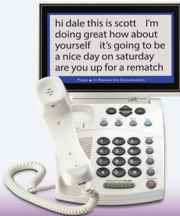
Hamilton® CapTel® 880i