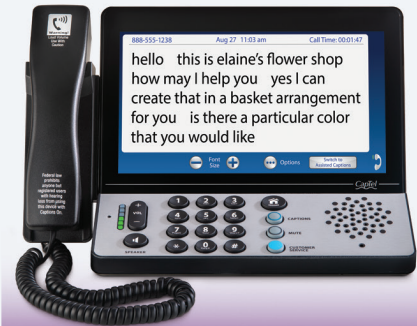
Hamilton® CapTel® 2400i