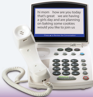
Hamilton® CapTel® 840i