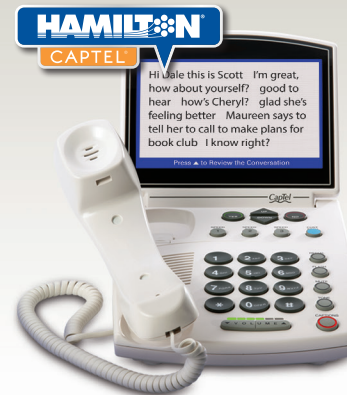
Hamilton® CapTel® 840i

The Hamilton CapTel phone requires telephone service and high-speed Internet access. Wi-Fi capable.