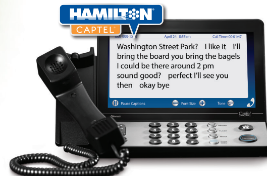
Hamilton® CapTel® 2400i