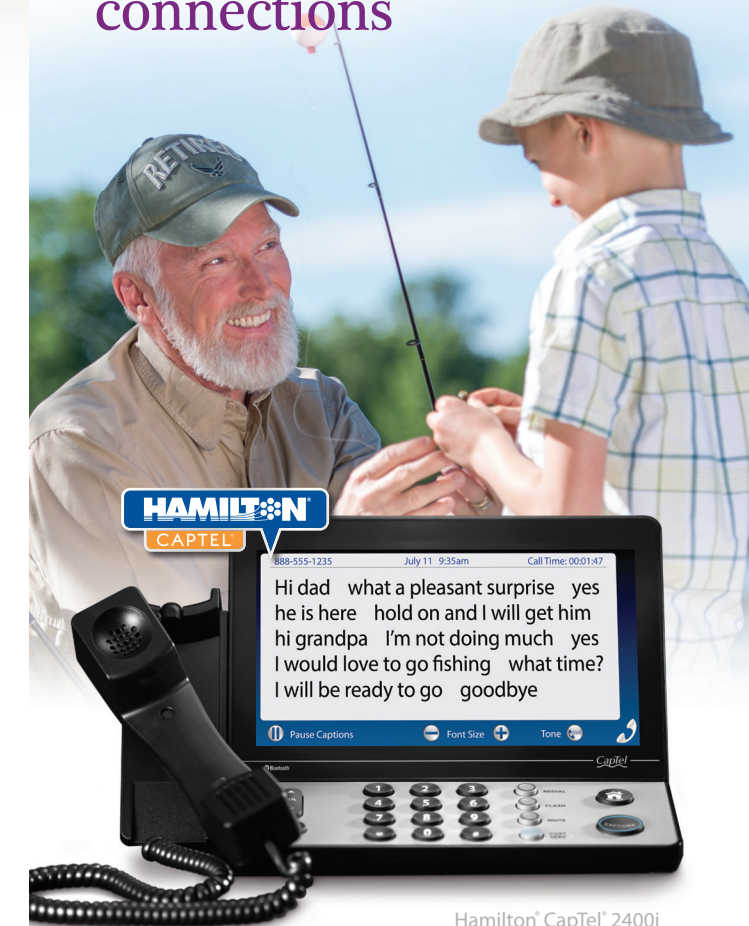
Hamilton® CapTel® 2400i

Amazingly clear phone conversations available at no cost! 1