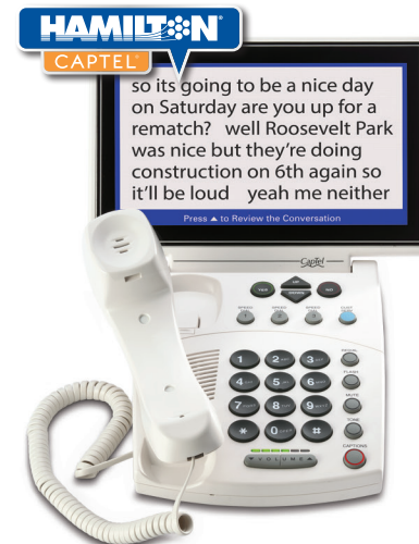
Hamilton® CapTel® 880i