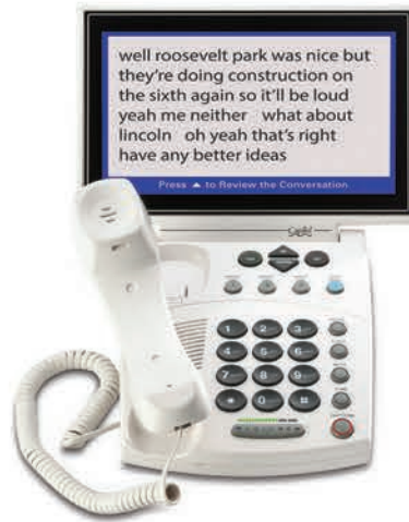
Hamilton® CapTel® 880i