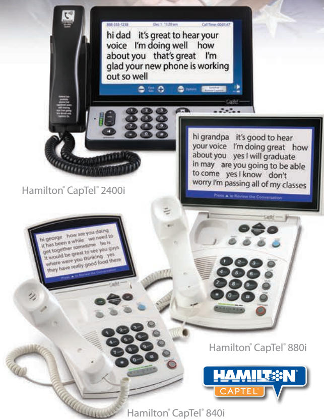
Hamilton® CapTel® 2400i

That's it! We'll contact you to verify your information and confirm the preferred delivery method noted on your form (installation assistance is available). Easy as 1-2-3!