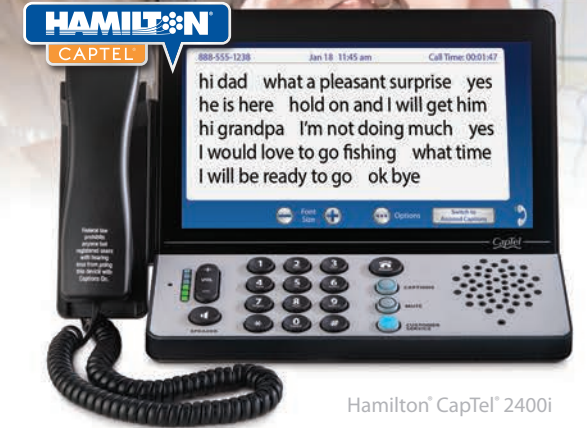
Hamilton® CapTel® 2400i

Amazingly clear phone conversations available at no cost!