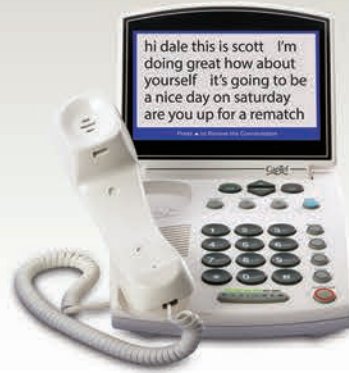
Hamilton® CapTel® 840i