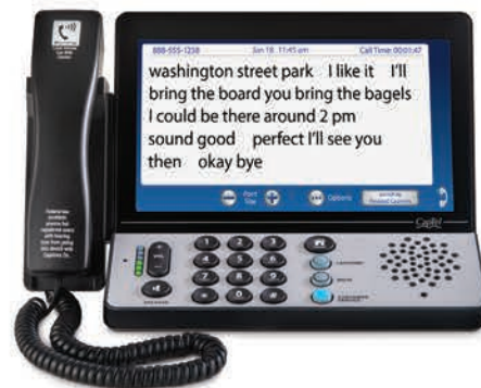
Hamilton® CapTel® 2400i